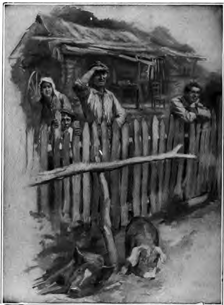
They took us for the advance-guard of a circus.